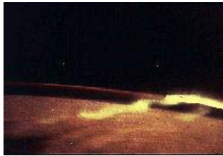
Figure 3 Airglow at 100 km seen from space

atmosphere. This exploration of atmospheric coupling will involve climate dynamics (ENSO, AO, etc.), ionization and photochemical reactions in the upper atmosphere, and the global electric circuit. The Janus concept responds to ongoing initiatives in the United States and elsewhere to develop whole-atmosphere models of dynamics and composition (MAGCM, WACCM, NOGAPS).