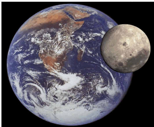
Figure 1 View from L-1 when the moon is in the field of view

Introduction: The key goal of a proposed joint Earth-Sun mission to L-1 is to understand the relationship between solar activity and the structure and dynamics of Earth’s atmosphere from the surface to the thermosphere-ionosphere for a range of seasons, solar radiation and energetic particle inputs.